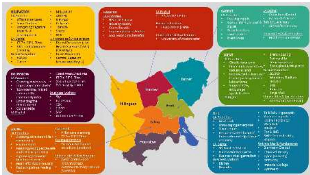
Figure 1 – West London Borough Priorities for Growth and Digital Business and Innovation Anchors

4.4 The scale and range of activity across the public and private sector means West London has a strong investment case for digital investment and transformation. Figure 1 provides an overview of the priorities for growth and digital business and innovation anchors. At the West London level important sector opportunities include: